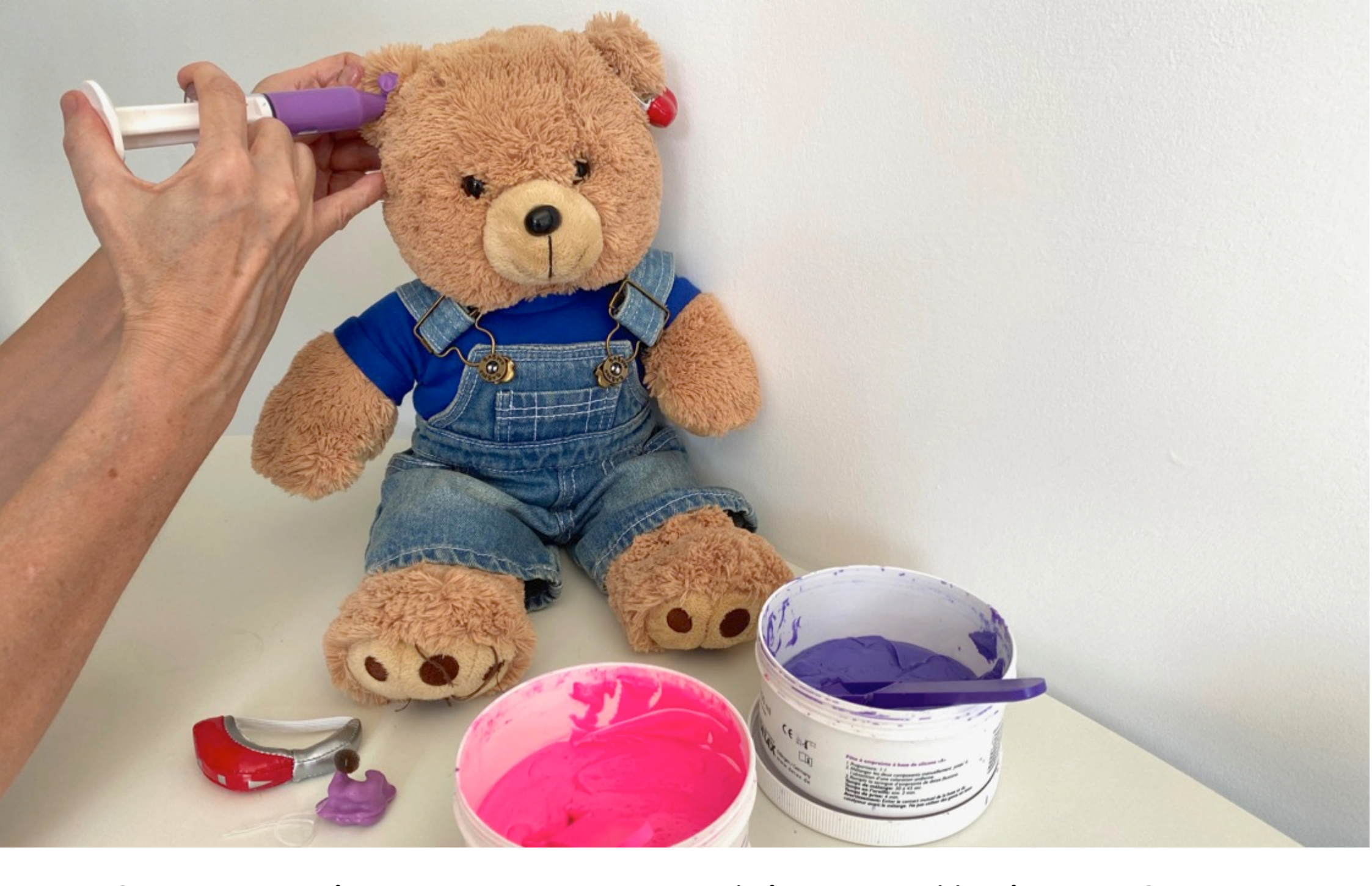
Ben needs new ear moulds. Well done Ben.