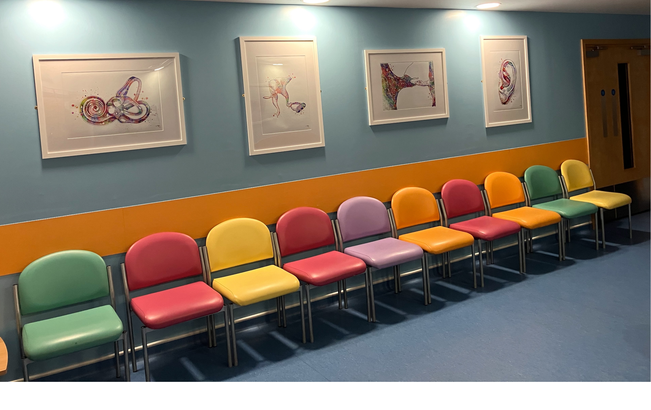
How many pictures can you count?