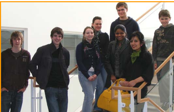
Youth Council members