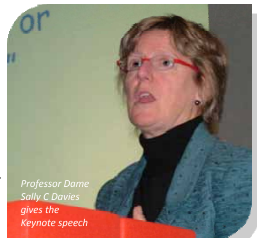
Professor Dame Sally C Davies gives the Keynote speech

In the afternoon, topics such as ‘The impact of patient and public involvement’ and ‘Delivering the national ambition for clinical